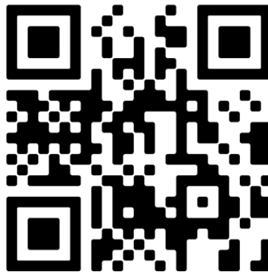
Loverboy Recruitment Video (Adult)